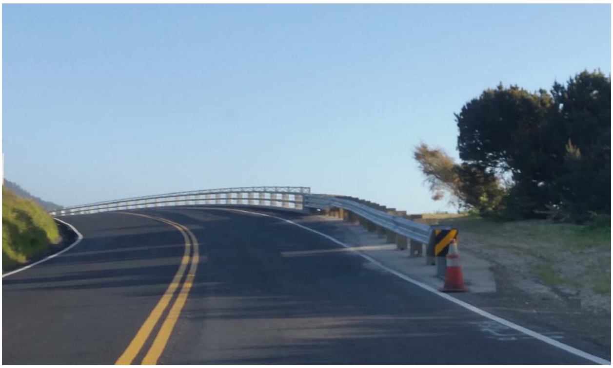
Close up showing proximity of north end of guard rail to the fog line.